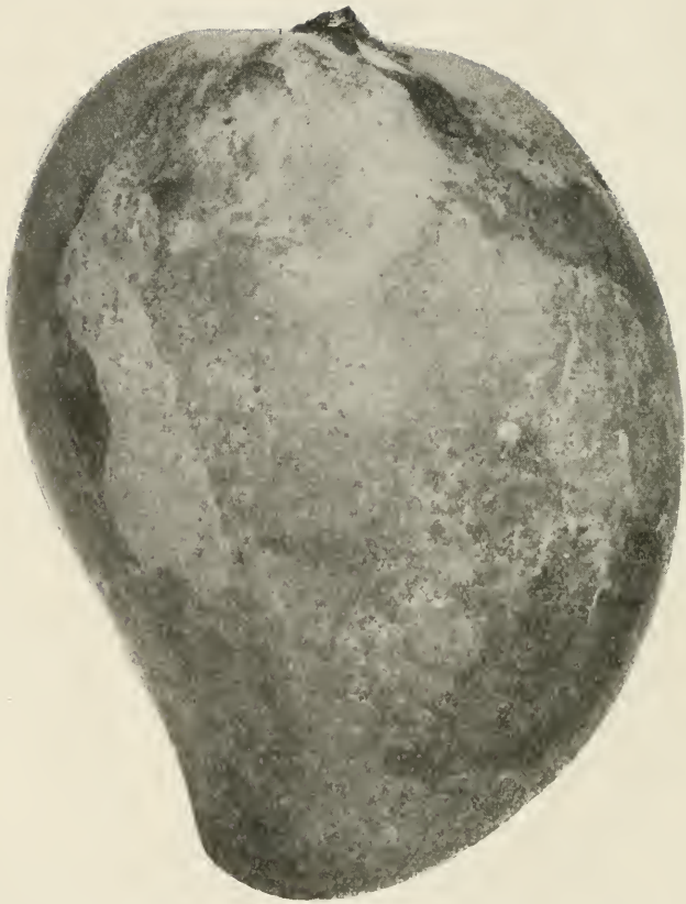
TYPICAL FRUIT OF THE MANGO RACE, SHOWING THE CHARACTERISTIC FORM. COMMON THROUGHOUT THE ISLANDS